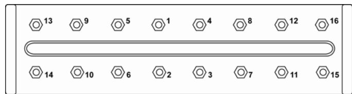
Figure 1—Bolt Tightening Sequence

Note: This document should be reviewed in its entirety prior to installation of equipment.