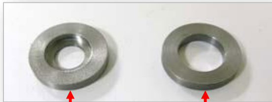
Lower Glass Support